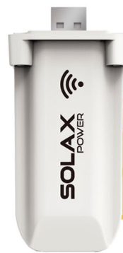
3rd Gen X-Hybrid